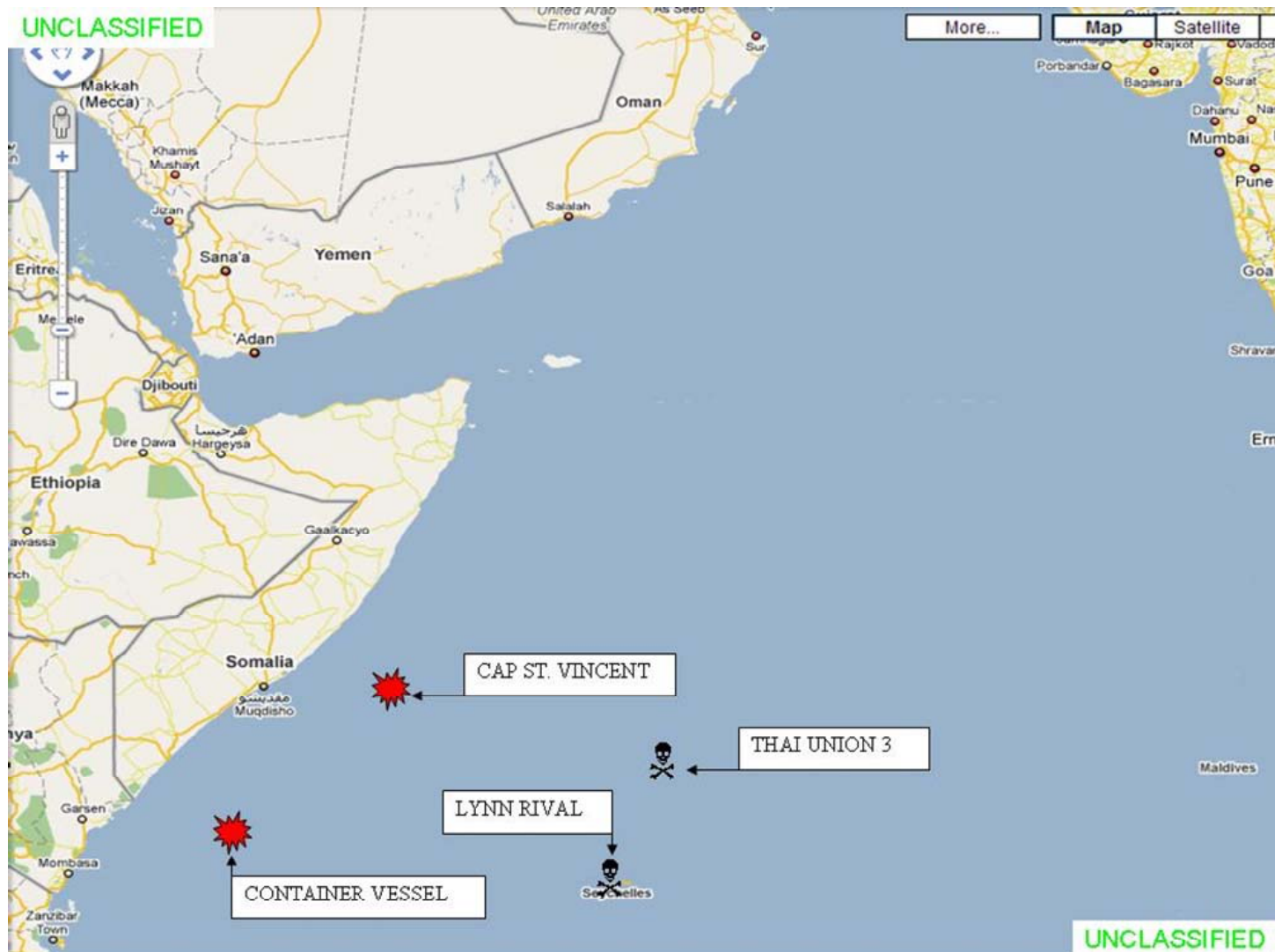
Fig 1. HOA pirate activity 23-29 October (IMB)